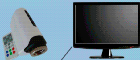
VGA LCD Monitor

The Accessory for machine vision YOU NEED